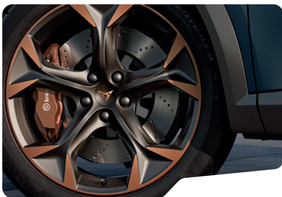
19IN EXCLUSIVE 38/5* SPORT BLACK / COPPER (PYA) F VZ ↑