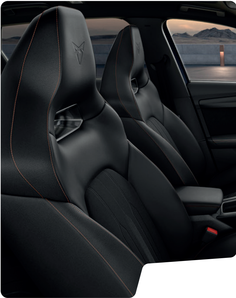
← TEXTILE BUCKET (AQ) VZ F