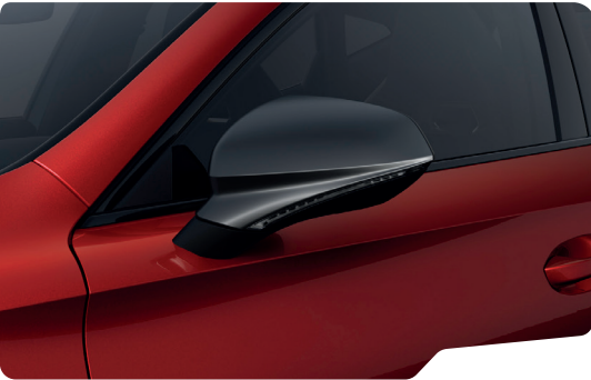
↓ DESIRE RED - E1E1* (Premium Metallic)