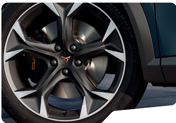
19IN EXCLUSIVE 38/3* SPORT BLACK / SILVER (PUW) F VZ ↑