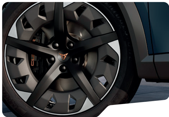
19IN EXCLUSIVE 38/4 AERO* SPORT BLACK / SILVER (P8V) F VZ ↑