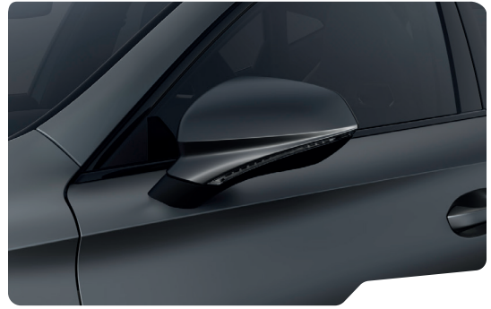
↓ MAGNETIC TECH MATT - 9R9R (Matt)