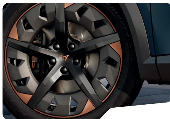
19IN EXCLUSIVE 38/6 AERO* SPORT BLACK / COPPER (P8W) F VZ ↑