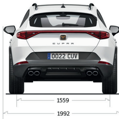
CUPRA Formentor 4WD