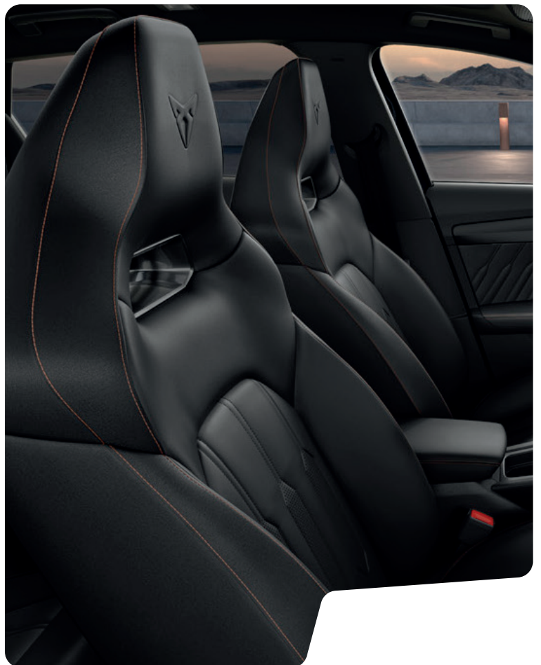
↓ GENUINE BLACK LEATHER BUCKET (LQ+W1D)** F VZ

Formentor F Formentor VZ VZ Standard ■ Optional ■