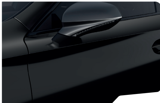
↓ MIDNIGHT BLACK - OE0E (Metallic)