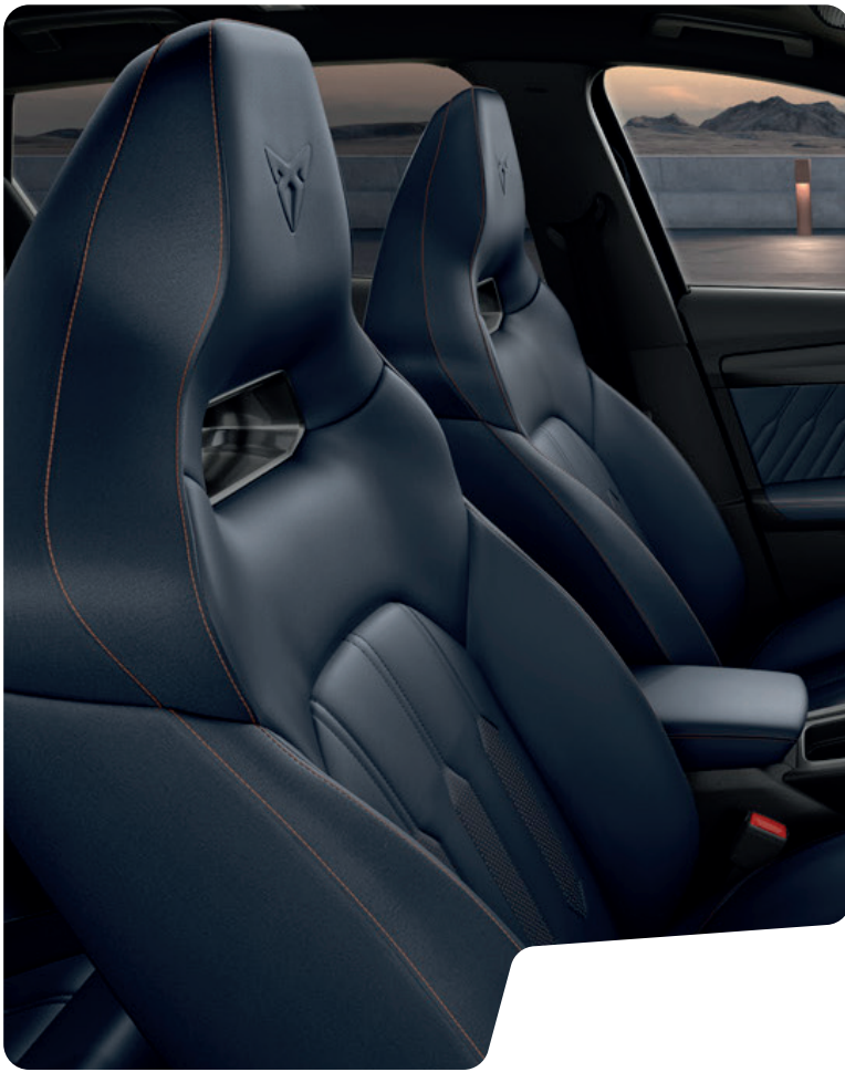
↑ GENUINE PETROL BLUE LEATHER BUCKET (TQ+W2F)** F VZ