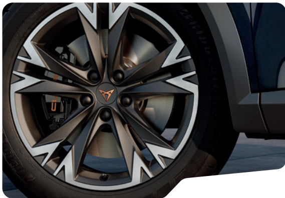
18IN PERFORMANCE 38/2* SPORT BLACK / SILVER (PUL) F ↑