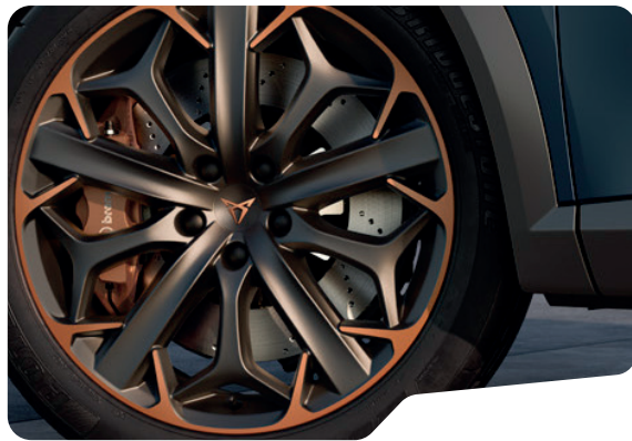
19IN EXCLUSIVE 38/7* SPORT BLACK / COPPER (PYB) VZ ↑