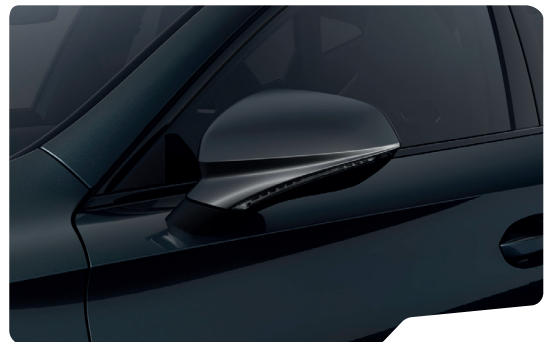
↓ MAGNETIC TECH - S7S7 (Metallic)