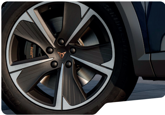
18IN PERFORMANCE 38/1* SPORT BLACK / SILVER F