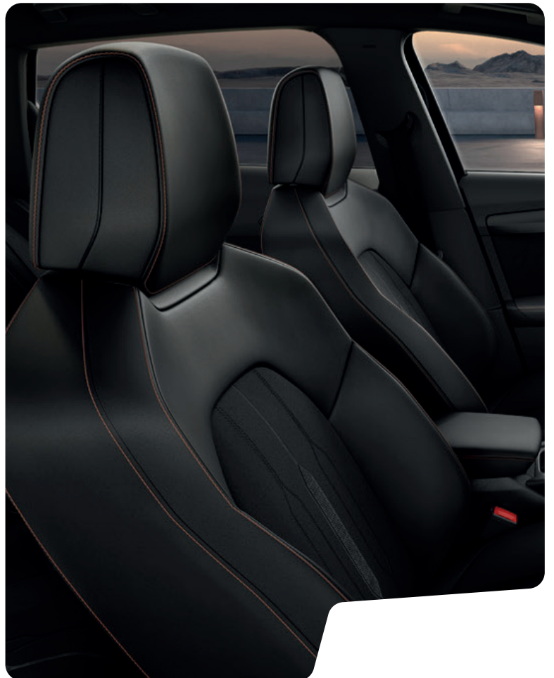
→ TEXTILE SPORT (AQ) F

Formentor F Formentor VZ VZ Standard ■ Optional ■