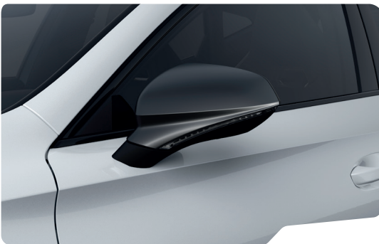
↓ NEVADA WHITE- 2Y2Y (Metallic)