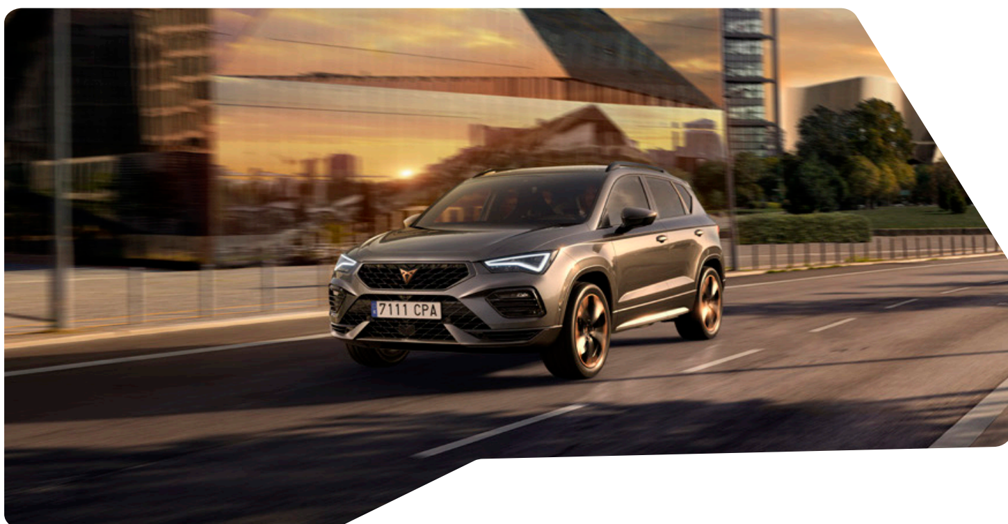
CUPRA ATECA- IMPULSE Standard Equipment

Images are shown for representative purposes only and may contain optional extras.