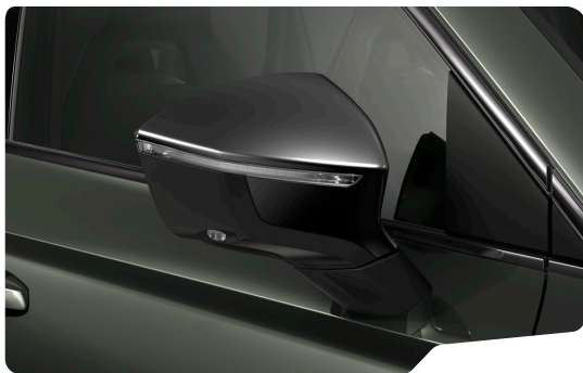
↓ DARK FOREST - 3C3C (Special Metallic)