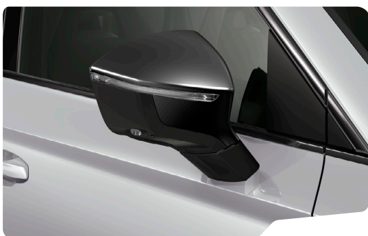
↓ NEVADA WHITE - 2Y2Y (Metallic)