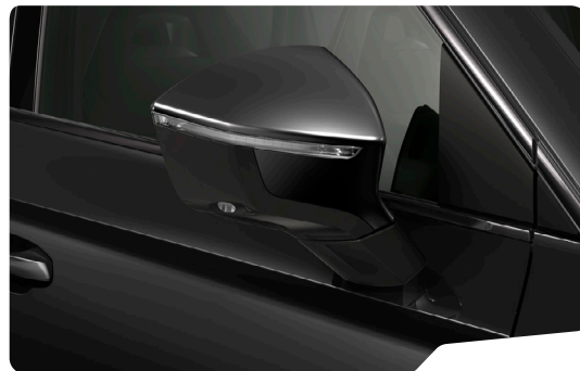
↓ MAGIC BLACK - 1Z1Z (Metallic)