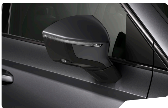
↓ GRAPHITE GREY - 5X5X (Metallic)