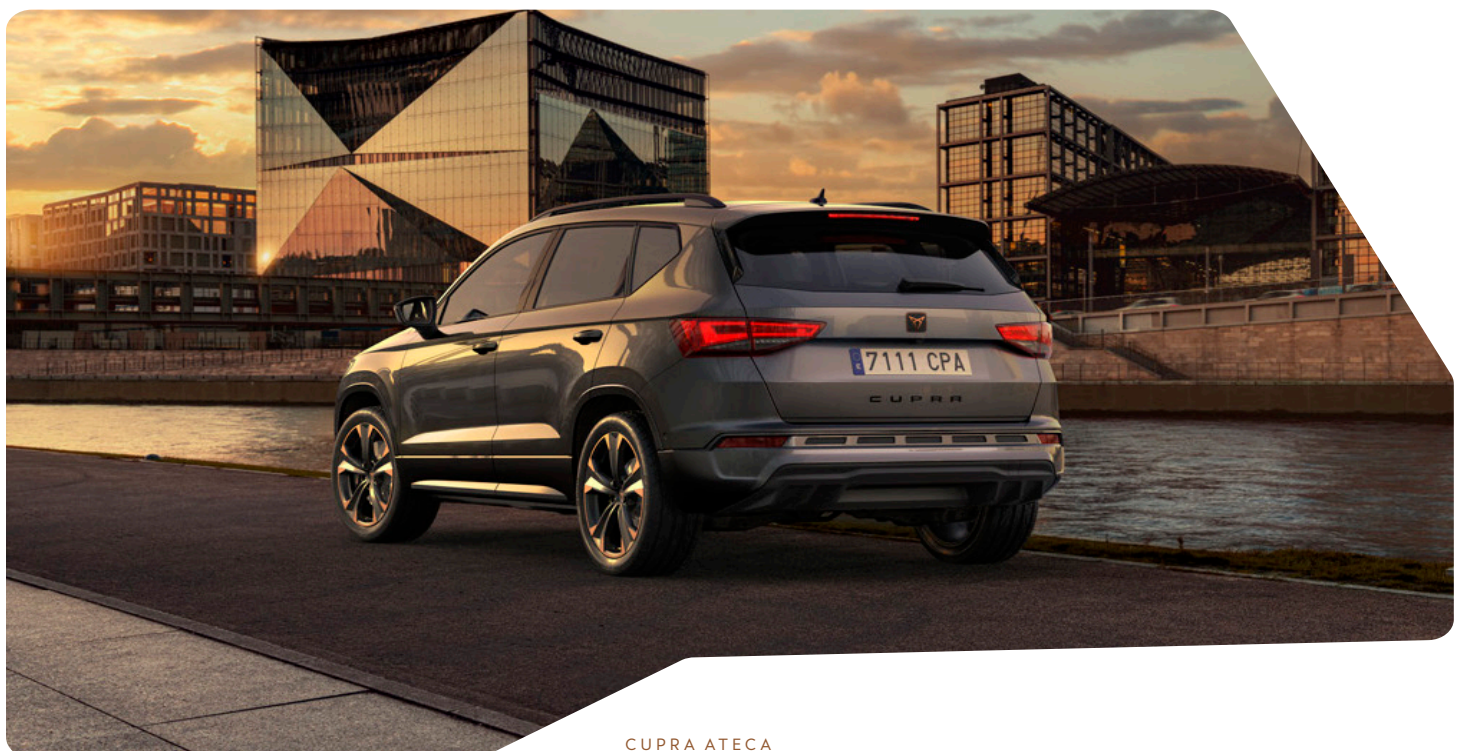
CUPRA ATECA Standard Equipment