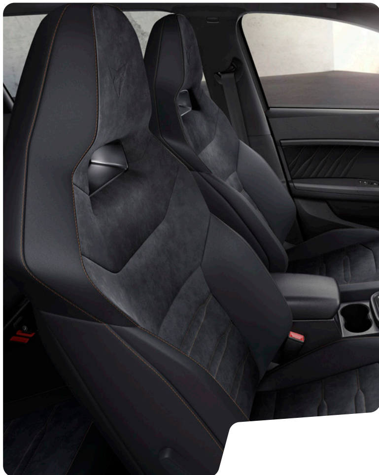
↑ BLACK ALCANTARA INTERIOR