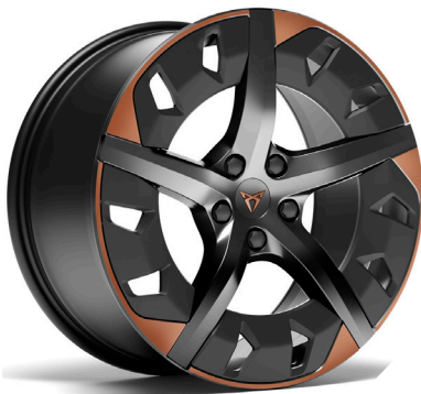
19IN AERO MACHINED SPORT BLACK / COPPER (P9C) ATECA VZ