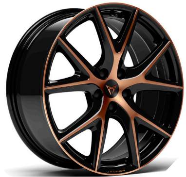
19IN MACHINED R SPORT BLACK / COPPER (PYA) ATECA IMPULSE VZ