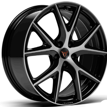
19IN MACHINED R SPORT BLACK / SILVER (PUW) ATECA IMPULSE VZ