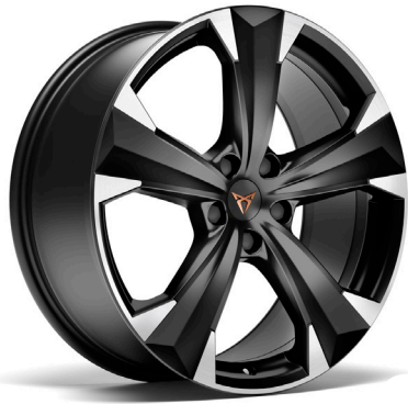
19IN MACHINED SPORT BLACK / SILVER ATECA VZ