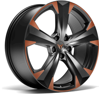
19IN MACHINED SPORT BLACK / COPPER (P8A) ATECA VZ