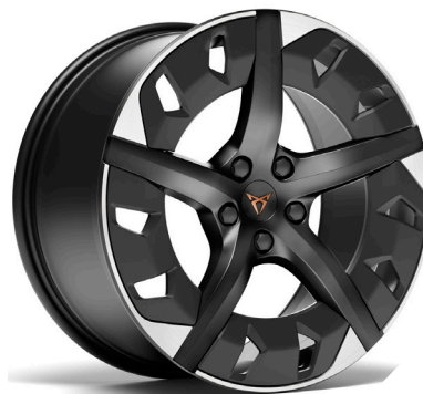
19IN AERO MACHINED SPORT BLACK / SILVER (P8V) ATECA VZ